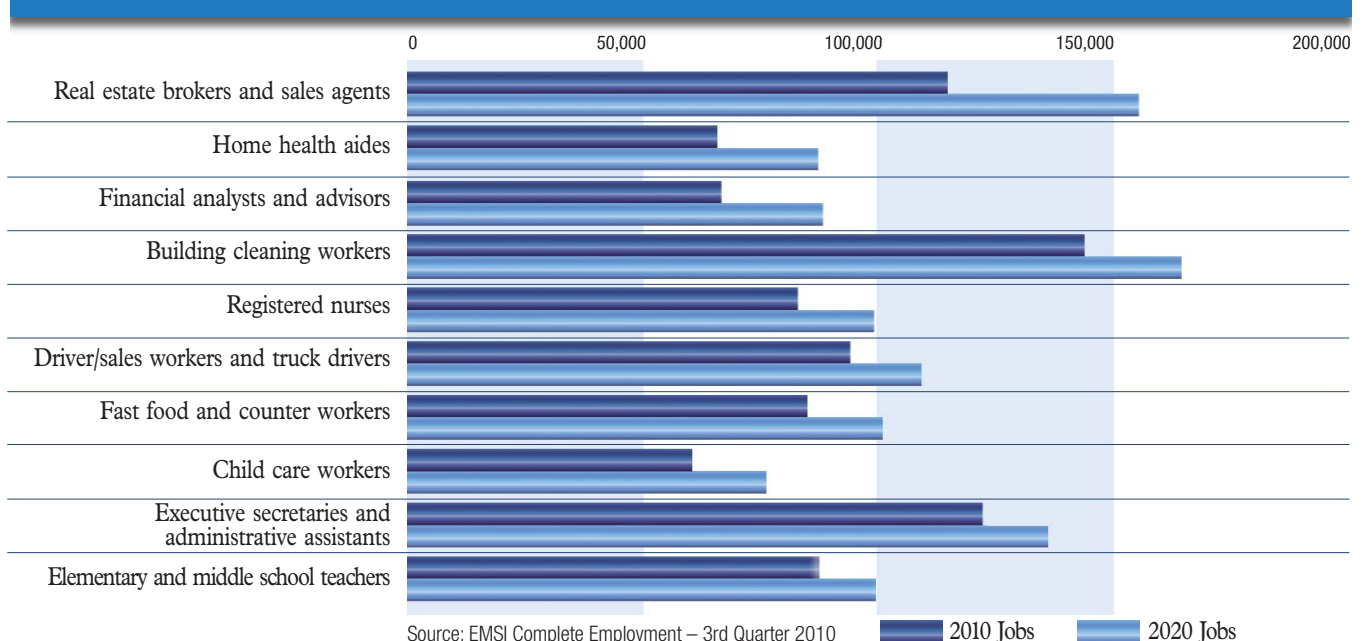
Metropolitan Chicago Region Fastest Growing Occupations Figure 9